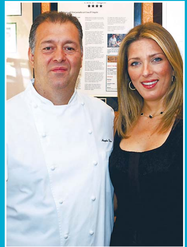
PACE CENTER FOR GIRLS