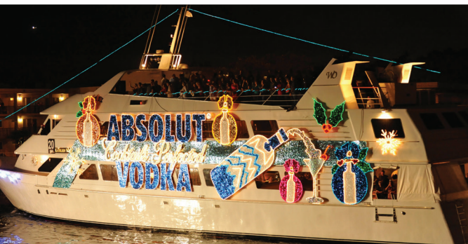
Products such as Absolut Vodka use the Winterfest Boat Parade to help with promotions.

Viewing of the parade (grandstand seats) start at $20. www.winterfestparade.com